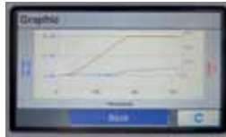
Graphic display of screwdriving graphs