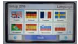
Web interface and controller display (available in 13 languages)